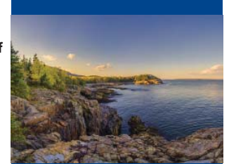
Explore Acadia National Park