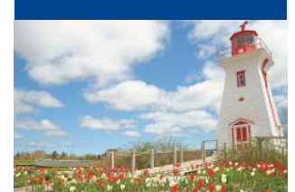
Visit to picturesque Prince Edward Island