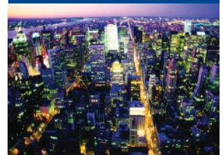
Guided Tour of New York City