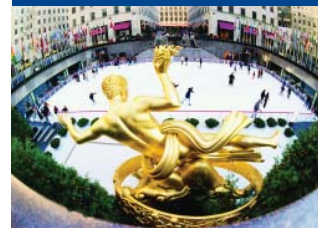
Explore amazing Rockefeller Center